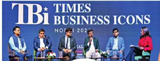
Industry leaders engage in a panel discussion, exploring the evolving role of leadership and sustainable practices