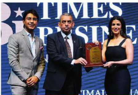
CP PLUS (ADITYA INFOTECH LTD.) CP Plus (Aditya Infotech Ltd.)

Emerging developer of the Year - Commercial