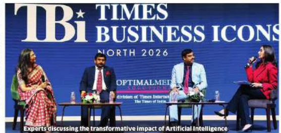
Experts discussing the transformative impact of Artificial Intelligence