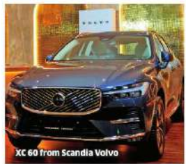
XC 60 from Scandia Volvo